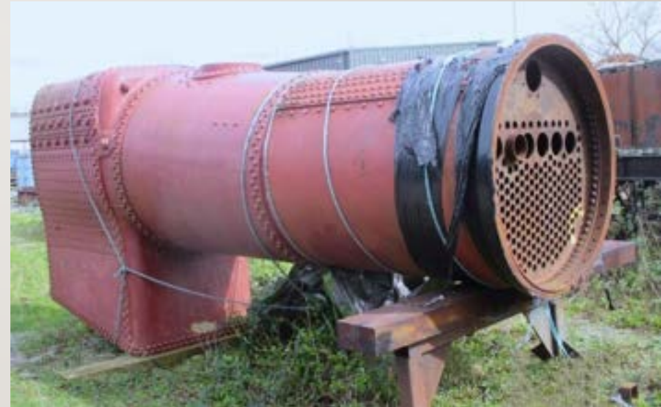
4561 boiler, now at Riley's Lancashire